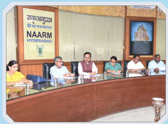
JAC meeting With NAARM