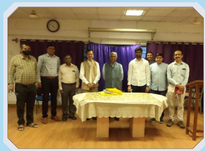
Vice-Chancellor interaction with Joint Organizations at GT Campus