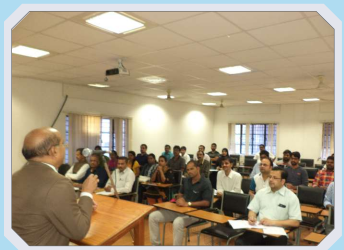
Justice Yethirajulu garu, guest lecture to DCJ & FS Participants