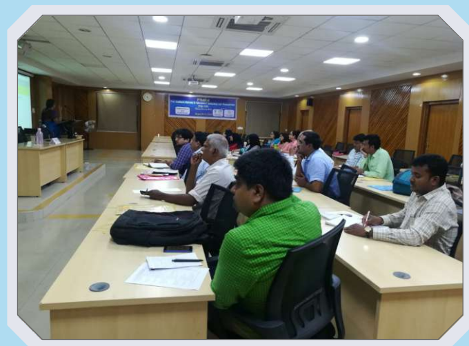
Participants of DETM Programme