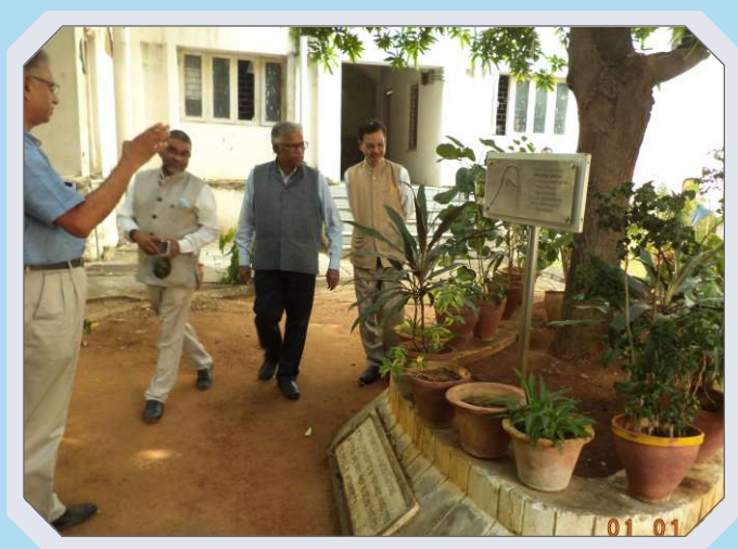
Sapling of Mango tree at GT Campus