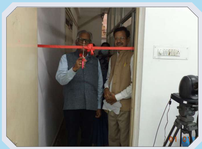
Virtual Recording room inaugurated by Vice-Chancellor