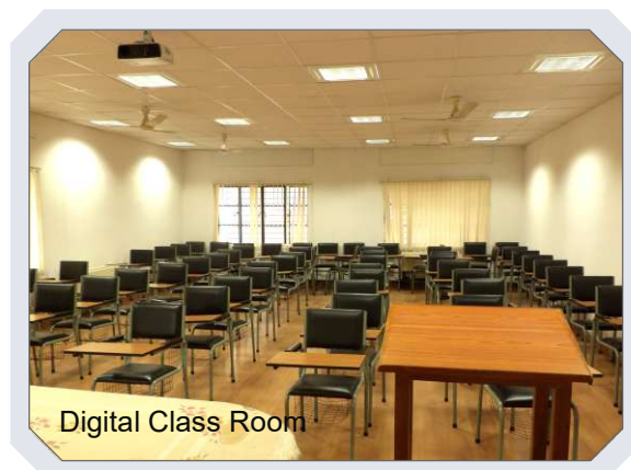
Digital Class Room