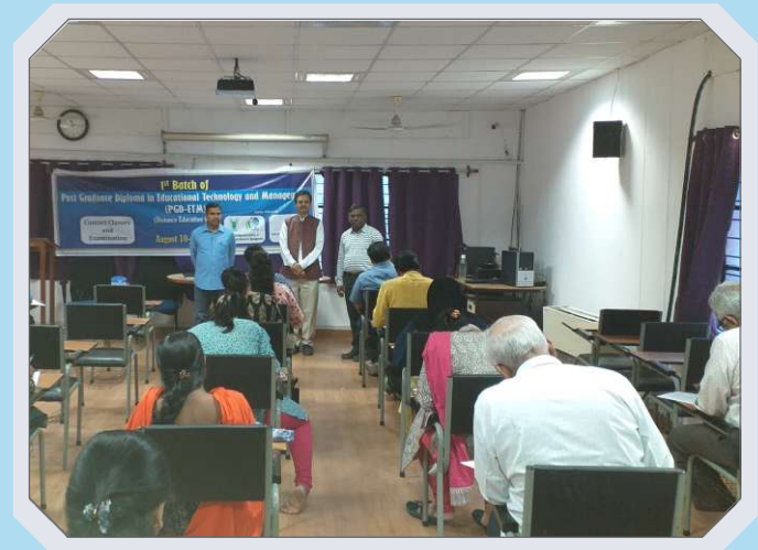
DETM Students attended Term End Exams at GT Campus