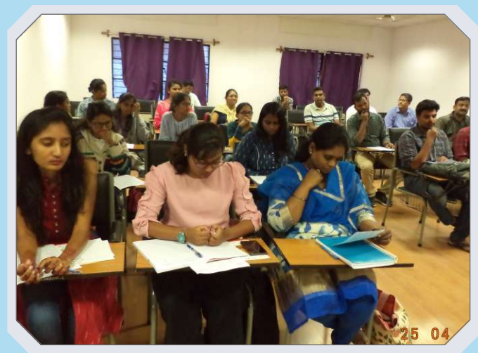
CJ & FS Students attending Contact Classes at GT Campus