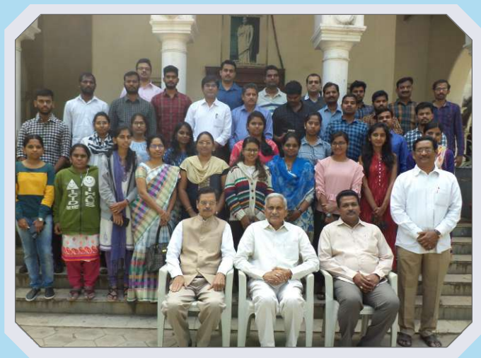
Group Photo with CJ & FS Students