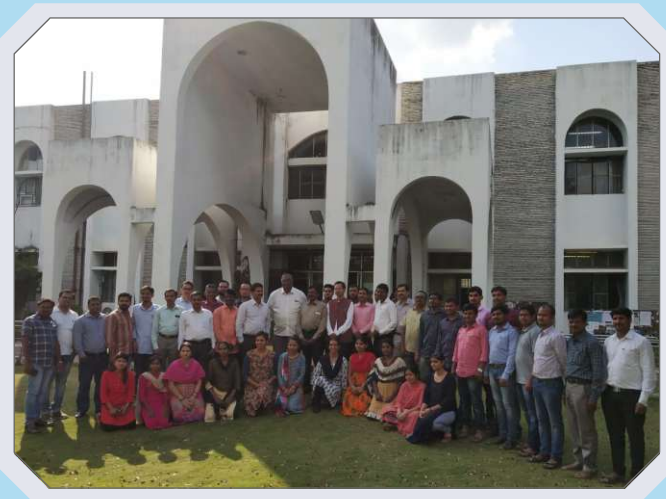
Participants of DLAN Programme